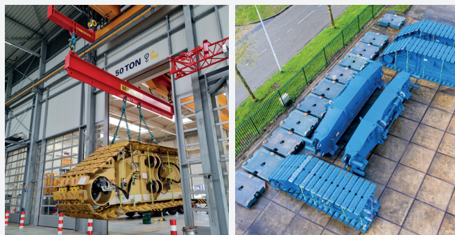
Photo report Demag CC 8800-1

✓ Aerial platforms ✓ Telehandlers ✓ Trucks